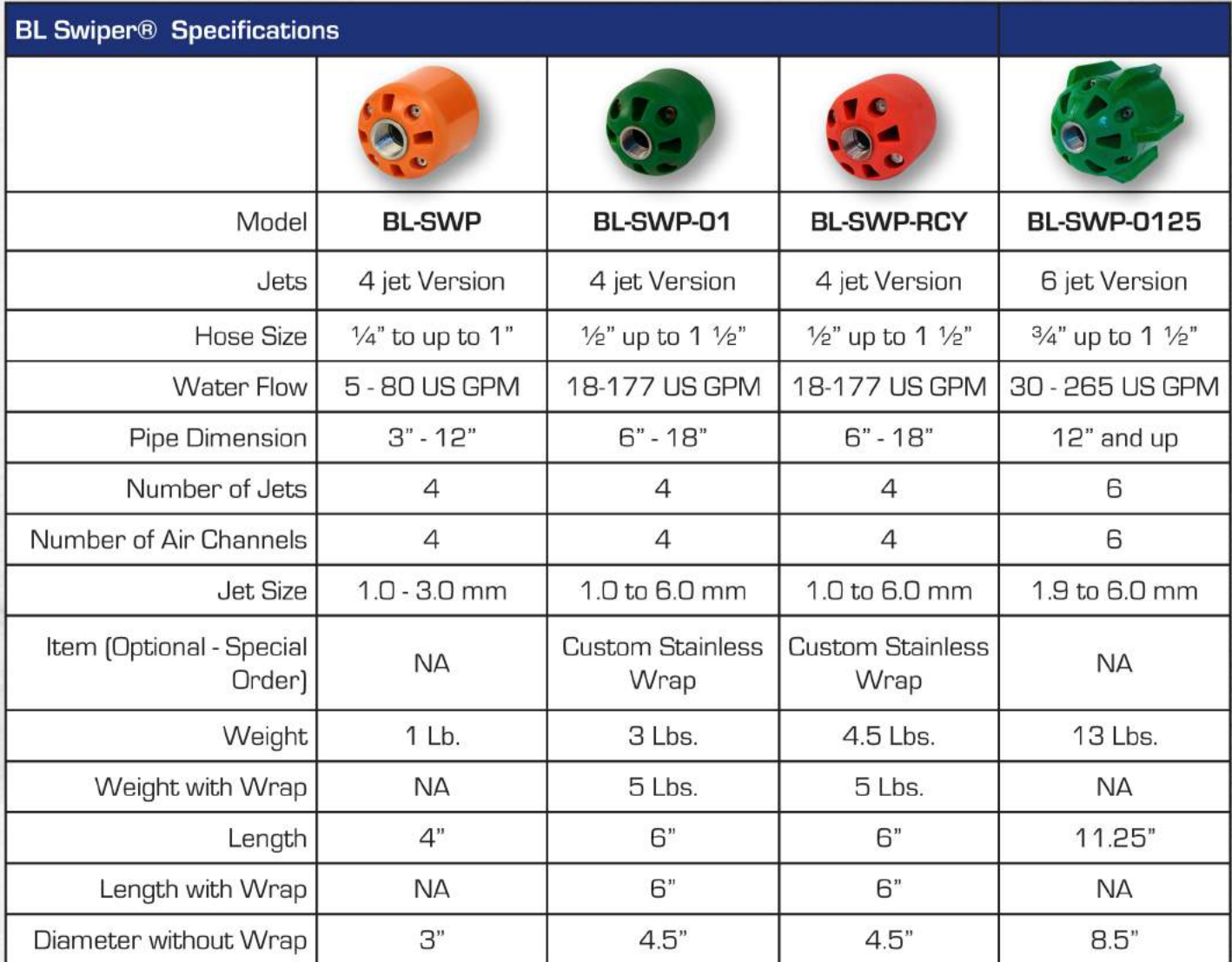
BL Swiper® Sewer Recycle Friendly BL-SWP-01