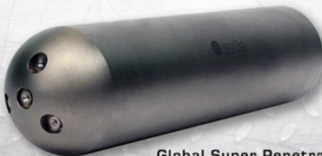
Global Super Penetrator

Note: Weights and dimensions are approximate and subject to change without notice.