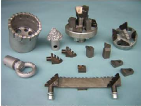
Photo shows root blades, carbide bits, tow ring and special swivel.