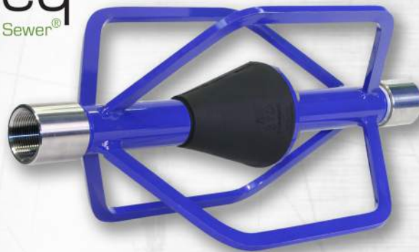
Orca™ Sewer Nozzle ORN01